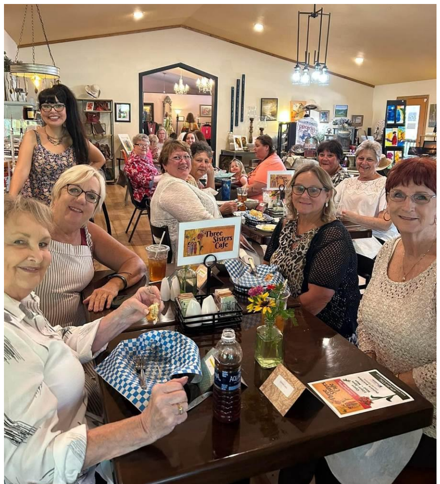
Guild Luncheon in August